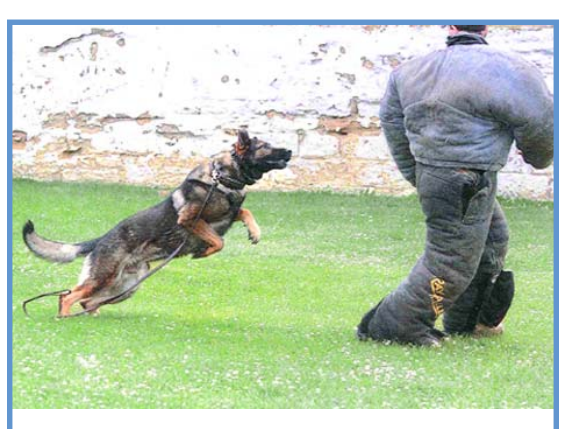
Above and below: Mock Prison Riot participants practice a variety of skills and techniques, including working with canines and scenarios dealing with maintaining and restoring order.

The MPR features several training scenarios coupled with technology