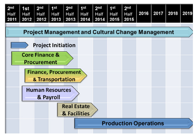
Above timeline from the wvOASIS newsletter

The project is not intended to reduce State jobs. On the contrary, it'll allow employees many opportunities to improve their abilities and learn new skills.